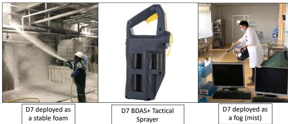
Figure 3: Multiple deployment for D7 make it highly effective for many scenarios

The final reason why D7 is so effective against SARS-CoV-2 is that it can easily be deployed by a variety of methods to handle any situation. It can be dispersed as a highly stable foam through existing foam generating equipment. When deployed as a foam, it clings to vertical and downward facing surfaces for 30 minutes or more to achieve long contact times against persistent toxic materials including biofilms. It can also be deployed as a liquid spray either through large-scale sprayers or from a hand-held spray can (i.e., BDAS+) which enables rapid deployment within seconds. D7 can also be deployed as a fog (or mist) from aerosol-generating devices primarily for interior decontamination – which is the ideal deployment method for both large and small spaces potentially contaminated with SARS-CoV-2. Finally, D7 can also be deployed by wetting microfiber towels and wiping touch points (e.g., door knobs, hand rails, escalator rails, etc.) where SARS-CoV-2 likely resides. Once D7 comes into contact with the virus, either in the air or on surfaces, it is quickly destroyed reducing the risk of infections to people in the area and reducing the potential for fomite transport. Most importantly, when D7 is deployed using any one of these methods, it eliminates SARS-CoV-2 even when it is embedded in soil, organic material, and bodily fluids which renders other disinfectants ineffective.